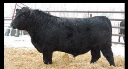
Maternal Grandsire - 1909