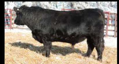
Maternal Sibling - 2012