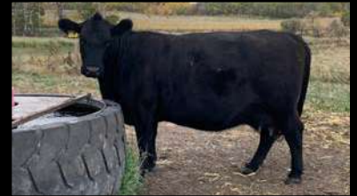
Grandam - 1426