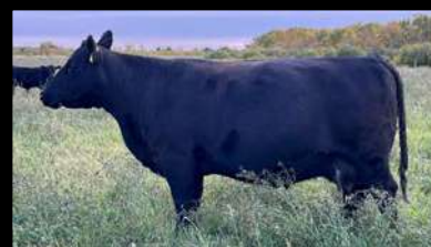
Dam - 1946