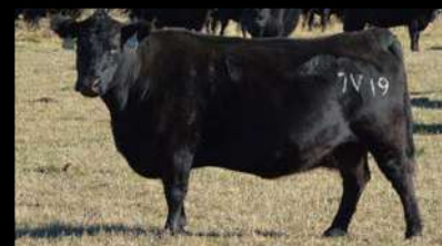
Dam - 7V19

A brief description of 5B02 would be...a sire of beautiful females. He is an absolute cow maker! No surprise, considering his nicely populated lineage of intense Emulation genetics. The first 5B02 daughters are coming eight years old for 2025. Teat and udder quality is on point, along with that pleasing feminine look. 5B02's daughters have quickly dominated our cow herd inventory.