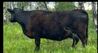
Grandam - 1331